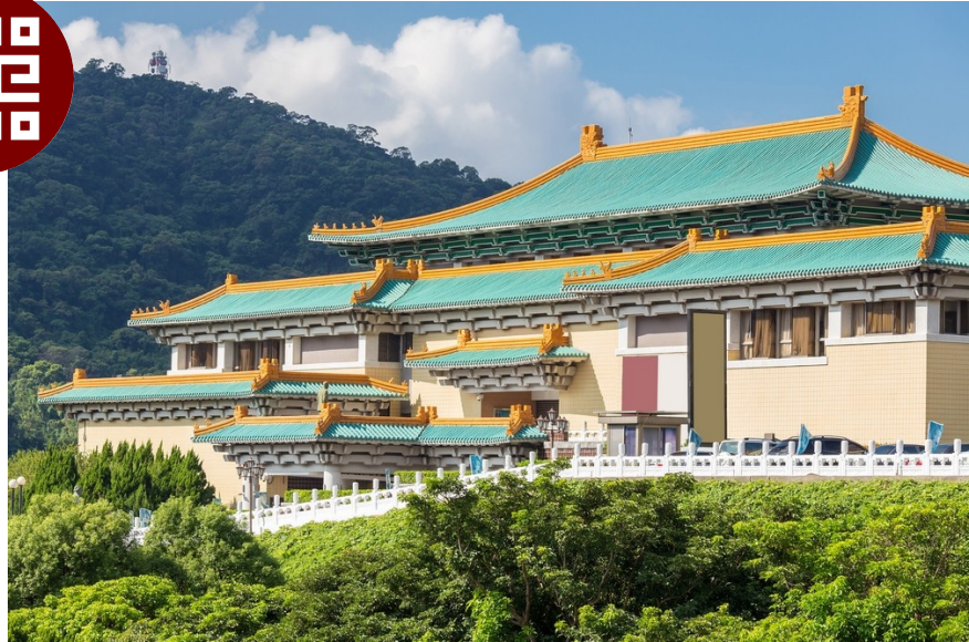
The National Palace Museum